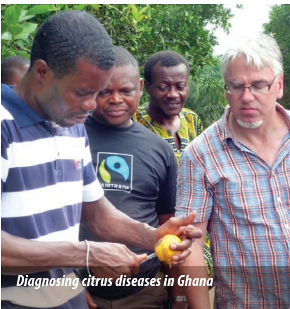
Diagnosing citrus diseases in Ghana

Capacity building programs are led by coaches based in the community, providing not just short-term training but continuous, year-round support. They also involve government extension officers as well as private firms