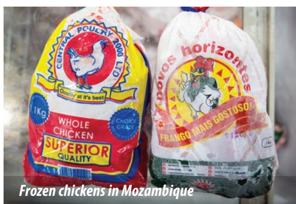
Frozen chickens in Mozambique