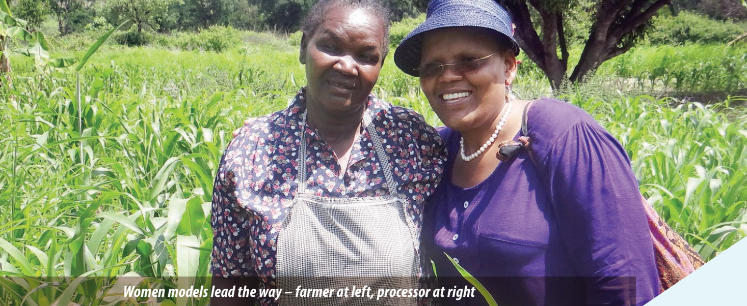
Women models lead the way – farmer at left, processor at right