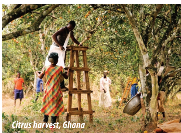
Citrus harvest, Ghana