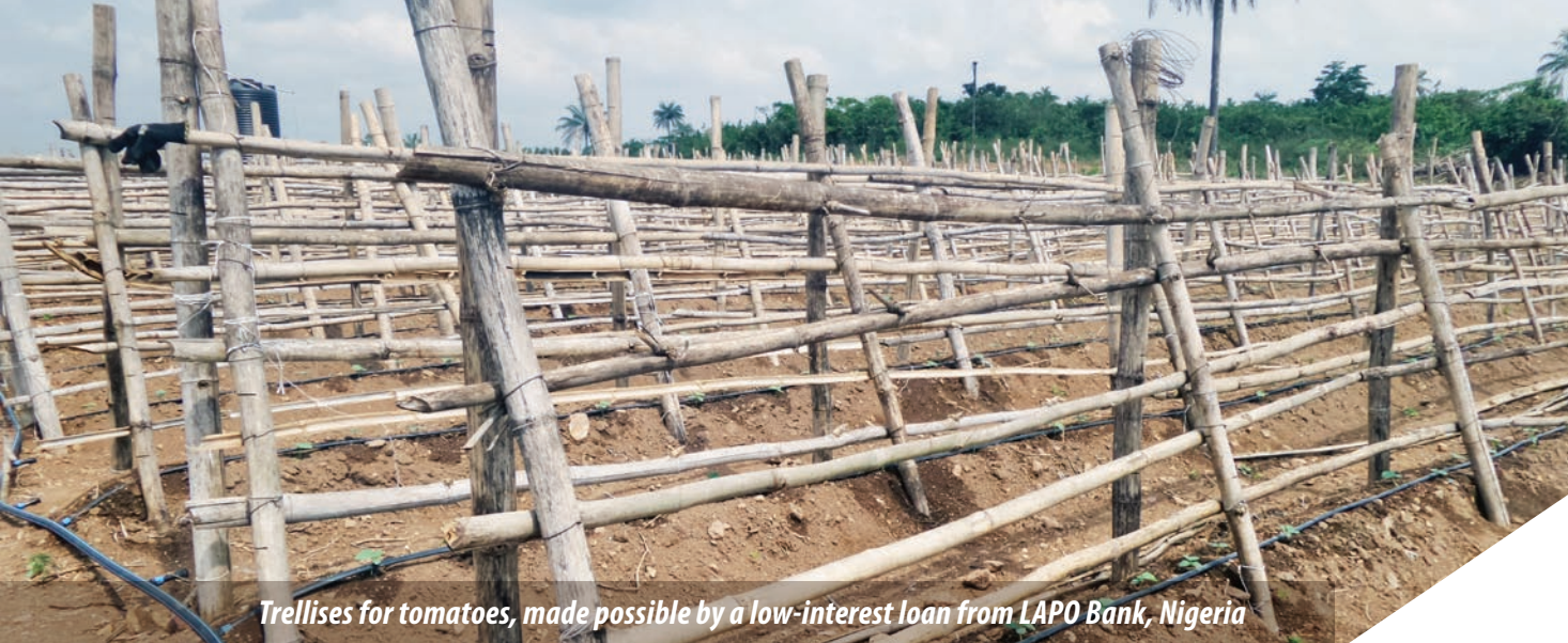
Trellises for tomatoes, made possible by a low-interest loan from LAPO Bank, Nigeria

entrepreneurs (700 women) in Ghana, and more than 7,000 in Kenya, created VSLAs. Three groups of rice farmers in Ghana collectively saved $64,000 in 6 months. VSLA savings can help convince banks that farmers are credit-worthy. For example, sorghum farmers in Kenya set up more than 200 VSLAs, with 6,000 members – and have been able to raise $60,000 in loans. Soybean farmers in Uganda have formed more than 400 VSLAs, each with its own ‘savings box’; and then leveraged these savings to borrow $70,000 (multiple small loans to VSLA members) from the formal market.