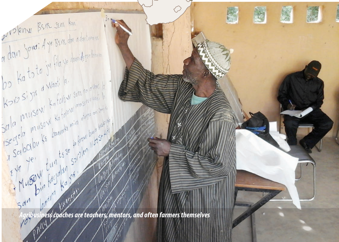
Agribusiness coaches are teachers, mentors, and often farmers themselves