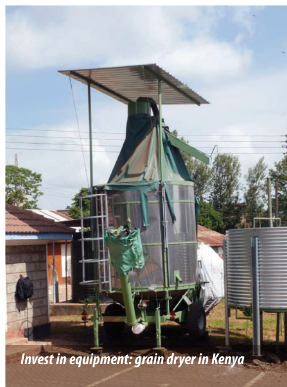
Invest in equipment: grain dryer in Kenya

In Benin, we helped broker a multi-partner arrangement between juice maker Promo Fruits, a pineapple farmers’ cooperative, FECECAM bank and input wholesalers. Before the season began, the cooperative received a working capital loan from FECECAM, ‘guaranteed’ by Promo Fruits. The money was paid not to farmers but to the input dealers for fertilizers and agrochemicals. After the crop was harvested and delivered to Promo Fruits, the cooperative deducted from individual farmers’ payments and repaid the loan.