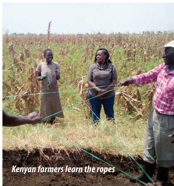
Kenyan farmers learn the ropes

Building capacity is not just transferring knowledge, but empowering farmers to experiment and learn-by-doing. We launched a farmer-led research program in Benin, where pineapple farmers selected three innovations (plastic mulch, blended fertilizer, planting shoots) that had succeeded elsewhere, but required fine-tuning to suit local conditions. Farmers conducted the tests on their own fields, and adoption grew rapidly. More than 1,200 farmers now use blended fertilizers, and nearly every farmer uses