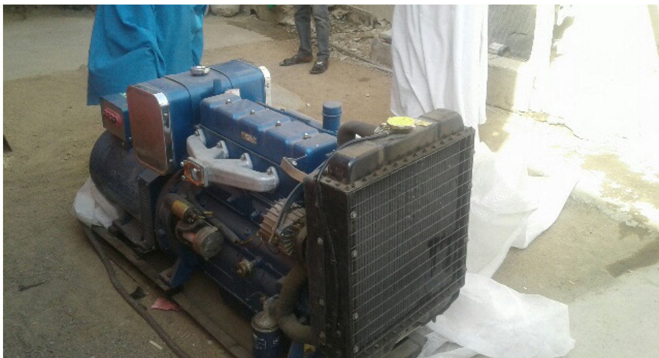
Electricity generator – a fixed asset acquired by a women's cooperative in Kano State