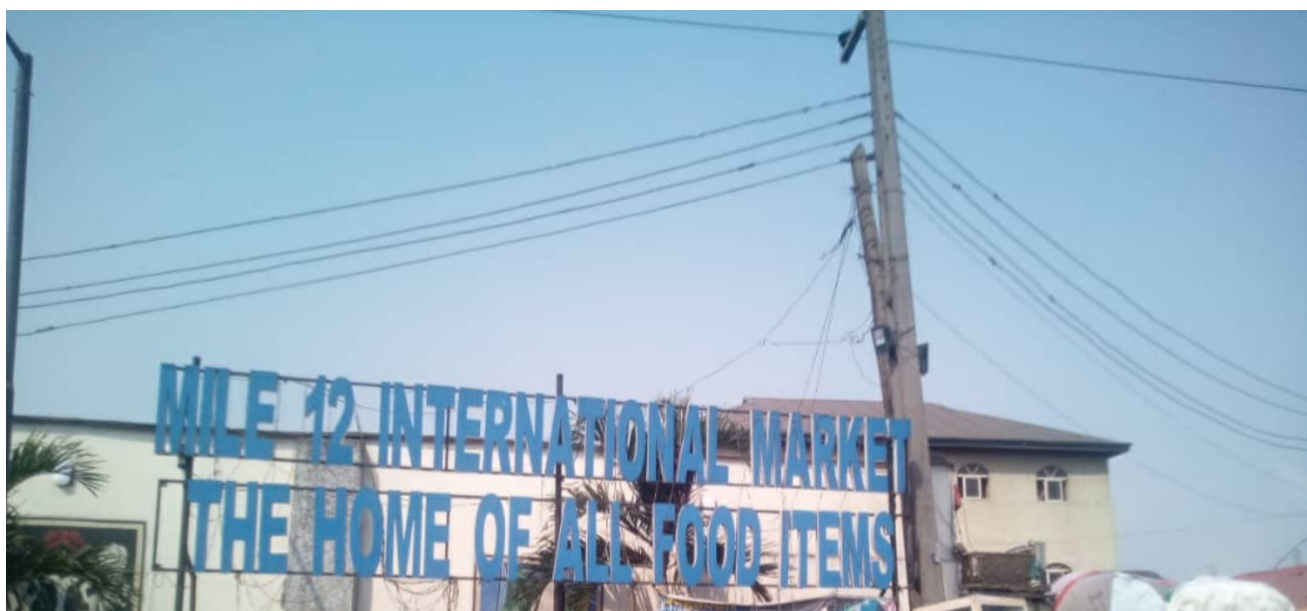
Mile 12 Commodities Market, Lagos State – the biggest market for vegetables in Nigeria; it links producers & traders in the north to traders in the south-west.

(d) Have statutory taxes been recognized?