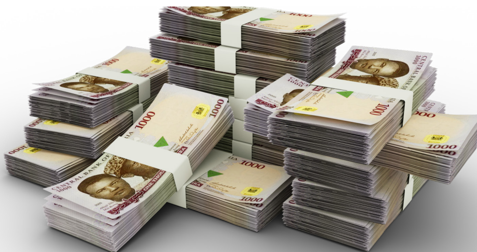
Illustration of liquidity

Financial literacy involves being able to make informed judgments and taking effective actions on the current and future use and management of money. It includes the ability to understand financial choices, plan for the future, spend wisely, and manage the challenges associated with life events.