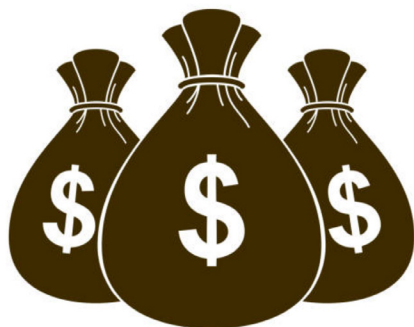
Traditional savings bag illustrated