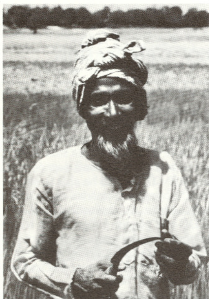
A Bangladeshi farmer prepares to harvest rice.

On his 1/4-hectare farm he manages to raise nearly enough rice and vegetables to feed himself and his family. His crops are subject to an erratic climate, which may bring periodic flooding or drought. Even in the best of times, life is hard in Bangladesh, having a per capita income of $130.