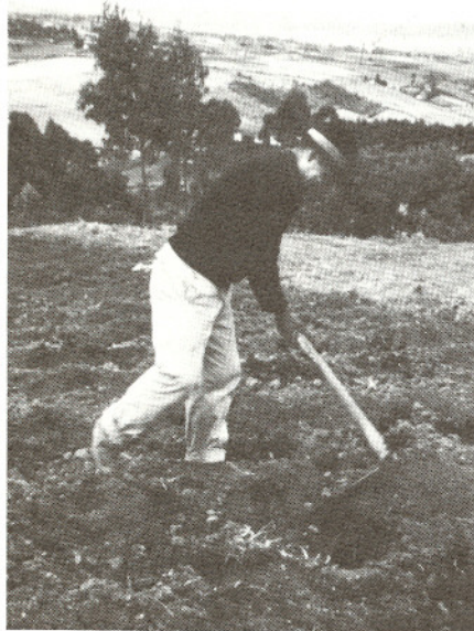
A Colombian farmer, collaborating with the IFDC/CIAT Phosphate Project, cultivates land prior to planting.

Colombian farmers are now using the phosphate fertilizers produced from the Huila and Pesca deposits because they are effective and less expensive than imported phosphates. They have seen the results of the IFDC-assisted phosphate project in their country. They are learning that phosphate fertilizer can significantly increase the yields of their crops such as beans, rice, potatoes, groundnuts, and cassava.