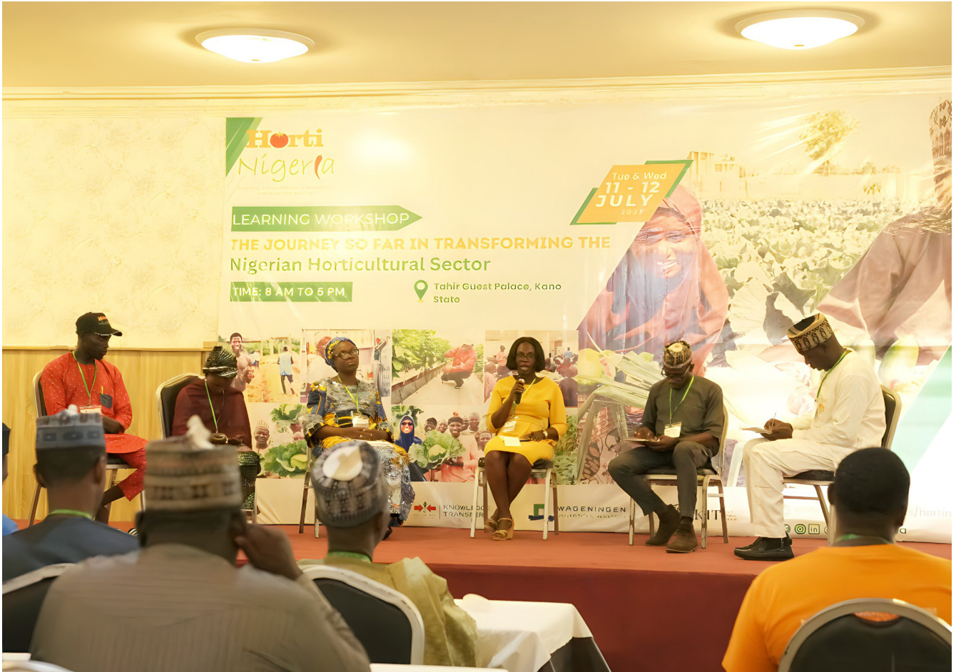
A cross section of the participants during a panel discussion session at the learning event, Kano State.