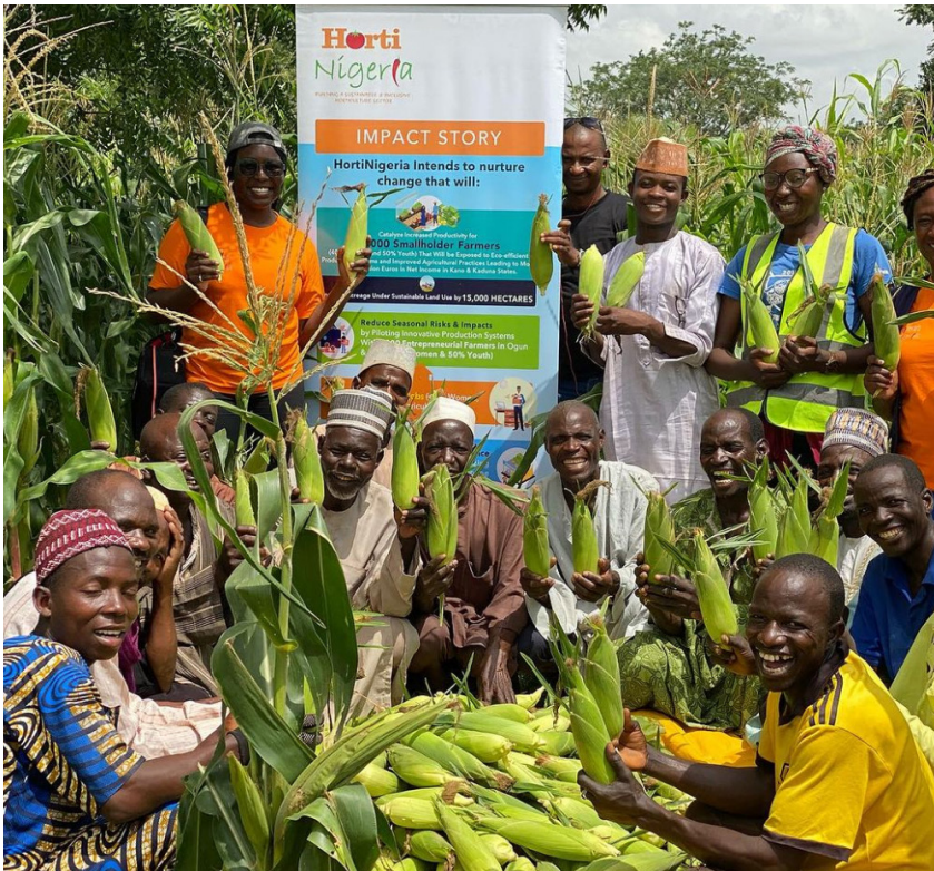
A cross section of the participants during a panel discussion session at the learning event, Kano State.