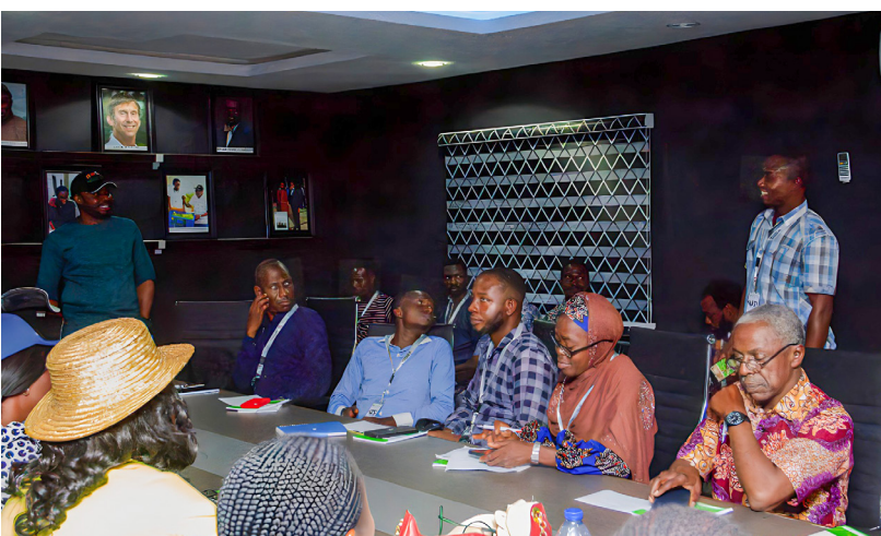
Cross section of participants at the roundtable forum, Ogun state.

The persistent labor shortage, further intensified by various fiscal transformations such as the Naira's redesign and the removal of fuel subsidies earlier in the year, has significantly impacted entrepreneurial farmers in the states of Ogun and Oyo. To tackle the challenge, it became imperative to initiate a roundtable forum