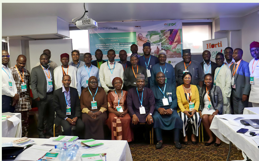
Participants at the FeSeRWAM workshop, Lagos State.

Participants in the workshop included key stakeholders in the horticulture value chain, such as National Horticultural Research Institute (NIHORT), National Agricultural Extension and Research Liaison Services (NEARLS), West African Fertilizer Association (WAFA), Nigeria's Institute for Agricultural Research (IAR), Dangote Fertilizer, OCP Africa, Indorama, Zaria Fertilizer, Federal Ministry of Agriculture and Food Security (FMAFS), and Notore Fertilizer. This collaboration is poised to enhance agricultural practices, increase crop yields, and empower Nigerian vegetable farmers.