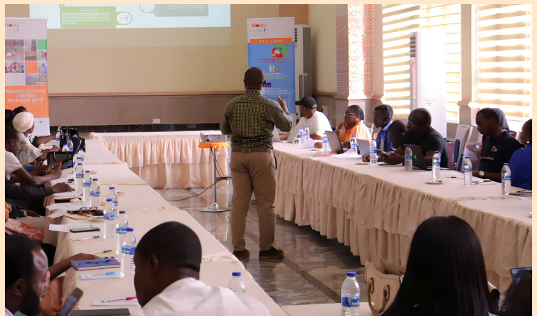
Some participants during a presentation session at the financial linkage workshop, Ogun State.

During the workshop, attendees participated in group discussions, presentations, and networking opportunities, delving into the potential for stronger financial connections. The highlight of these sessions was the spotlight on success stories, and how to replicate such in the Nigerian Horticulture sector, particularly among HortiNigeria's Business Champions.