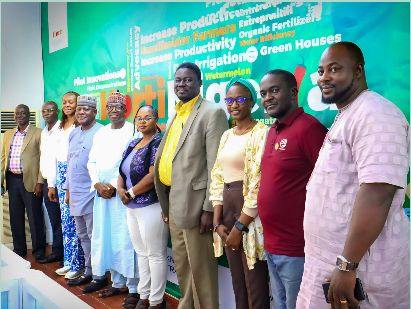
Delegates from CropLife with some HortiNigeria team members in IFDC, Abuja.

This engagement with CropLife International propelled HortiNigeria's ambition towards building strategic partnerships to foster resilient and sustainable agricultural practices contributing to the broader goals of food security and environmental stewardship. In 2024, HortiNigeria intends to join forces with CropLife International in a concerted effort to empower 600 young individuals, irrespective of gender, transforming them into proficient spray service providers. This initiative ensures that these newly trained youths are well-equipped to extend essential crop protection services to the farming community within their sphere of influence, while also dispensing valuable agricultural advice. ■